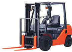
The model shown is 8FD25