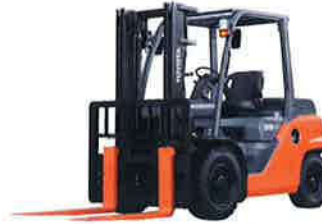
The model shown is 8FD35