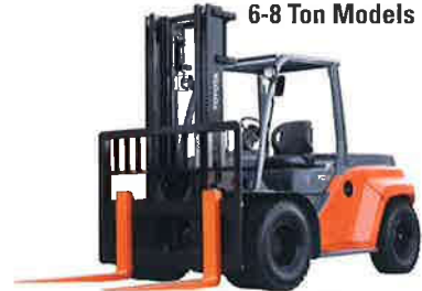
The model shown is 8FD70